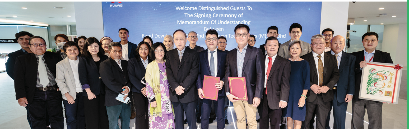
Witnesses of the MoC Signing Ceremony

Huawei Malaysia will provide Rand with a wide assortment of industry-leading ICT products and solutions, including IoT communications modules and operating systems, wired and wireless access, agile networks, cloud-based distributed data centers, and big data platforms. The collaboration between Rand and Huawei could lead to a new leap in project intelligence and data transformation.